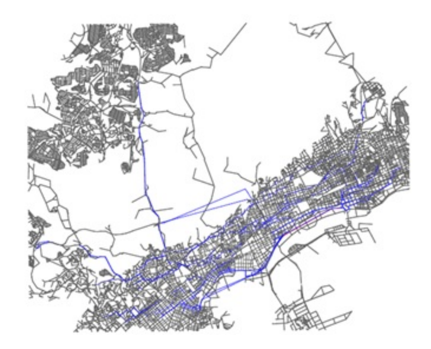
Figure 6.1: Road segments appeared in the 33 factors from 160 Monte Carlo events were shown with blue lines in a road map of the Kobe city. It is observed that the national roads, high way, and other major roads are extracted from the simulations.